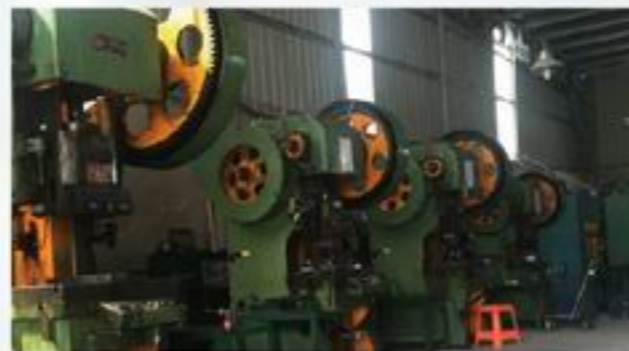
冲压车间 Stamping Workshop