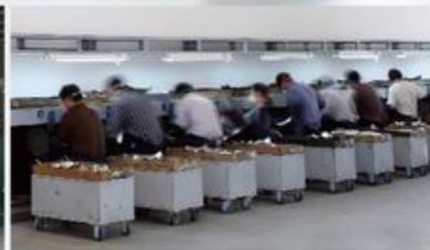
抛光车间 Polishing Workshop

EuroAmoy is specialized in development & manufacturing of tableware made of stainless steel for the consumer and foodservice industries. Our product including: cutlery, fruit plate, serving tray, kitchen knife, etc.